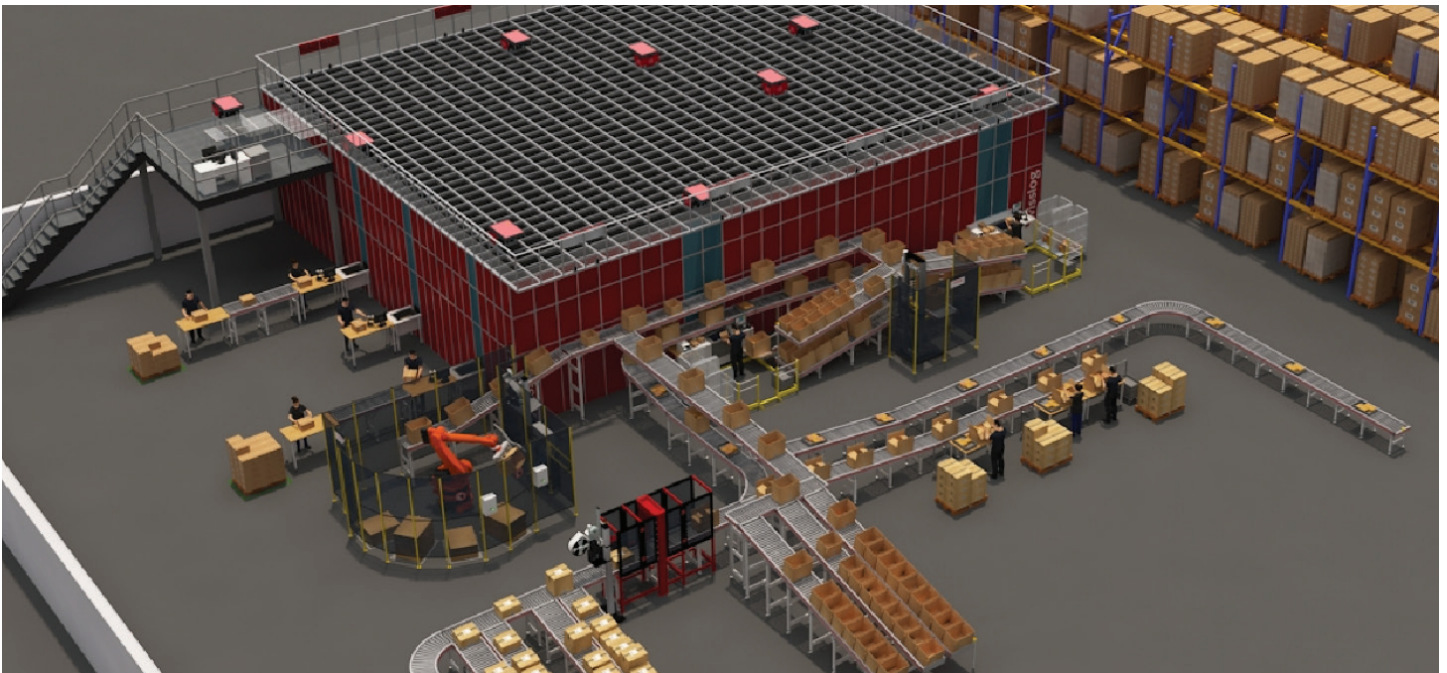
Pick-and-pass operation using conveyors and robotic carton erection cell to support the pick stations with order cartons of different sizes. Order cartons are automatically closed and labeled on their way to dispatch.

For one customer, Swisslog designed a pick-and-pack operation to support e-commerce picking as well as store replenishment using four different carton sizes. The resulting solution shows how much can be accomplished in a small space and demonstrates the potential to integrate AutoStore with other automated systems. In this case, a robotic carton-erection cell supports the pick stations, providing pre-labeled order cartons of multiple sizes.