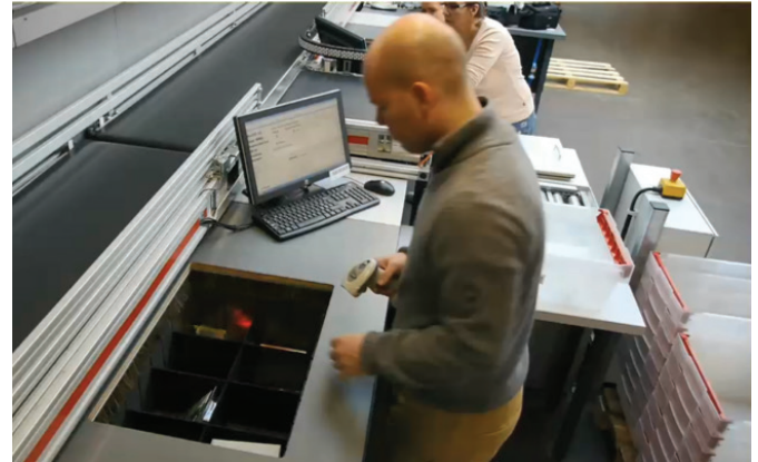
Single-conveyor pick-and-pass pick station.

In its simplest form, a pick-and-pass station utilizes a single takeaway conveyor for internal bins to be removed from the station. The operator takes an empty tote from a pallet, place it on their picking position and then start picking.