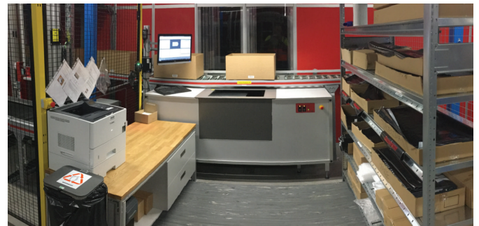
All-in-one pick station configuration.

A clothing retailer with ten different retail chains as well as an e-commerce channel, uses an all-in-one pick station designed by Swisslog to manage store replenishment, which is often done on an individual item basis, and e-commerce order fulfillment. The retail cartons go to a cross-belt that sorts cartons for dispatch and order consolidation while the fully packaged and labeled e-commerce orders go directly to a sorter.