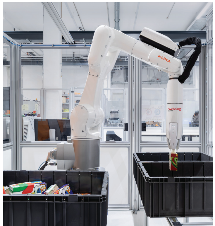
The next-generation Swisslog ItemPiQ.

Machine learning uses image data from the system to continually optimize system performance and the system's simple user interface enables quick set up with no knowledge of robotics required. When needed, the learning logic could be cloud-based to allow robots from multiple sites to share their learnings.